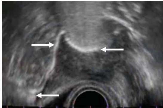
Figure 2 Uterine cavity, patent right tube and spillage in the abdominal cavity (the left tube is not visible in this plane).

glycerol, was introduced and registered for the dilatation of the uterine cavity during sonography, being an intrauterine medium for sonohysterography, as an alternative to saline (Exalto et al., 2007). When this gel is diluted and pushed rigorously through small openings in syringes or tubes, turbulence will cause a local pressure decrease resulting in air being dissolved in the solution, thus yielding foam that is stable for several minutes.